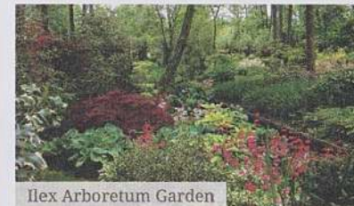
Ilex Arboretum Garden

Only remain of the ramparts that used to circle the city, the Porte d'Amont was built in 1629. It is from here that watchmen rang the belfry when a danger was to come. It also used to be the main door since it was utilised by the magistrates for their meetings.