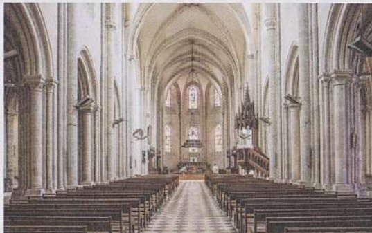
Saint-Liphard Collegiate Church

It has been destroyed in 1913 and replaced in 1945 by a covered hall, housing part of the market every Sunday morning.