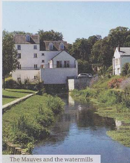
The Mauves and the watermills

Admire the Loire banks during a cruise on the “workshop boat”, a traditional covered boat, accompanied by “Cœur de Loire”, an association engaged in the conservation and valorisation of the Loire Valley heritage.