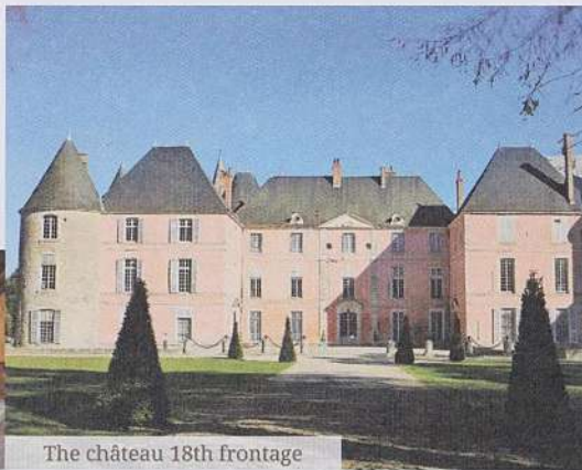
The château 18th frontage

It is one of the oldest and largest château in the Loiret department. He has the particularity of having two frontages from different periods: one medieval from the 13th century, the other one, classic, from the 18th century.